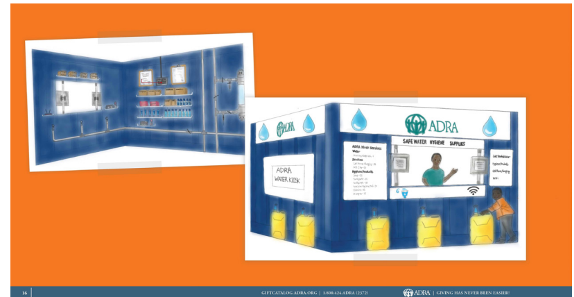
ABOVE PICTURE is a diagram of an ADRA Water Kiosk. THANKS TO YOU Vacation Bible School brought in $1,410.33 for the ADRA Kiosk Water Project in Mozambique.

As always, if you would like to help with our pickups or deliveries, please contact Wanangwa or Bev. Thank you!