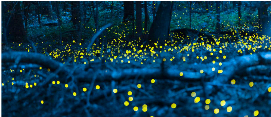
Synchronous Fireflies light up the forest at dusk at Congaree National Park.