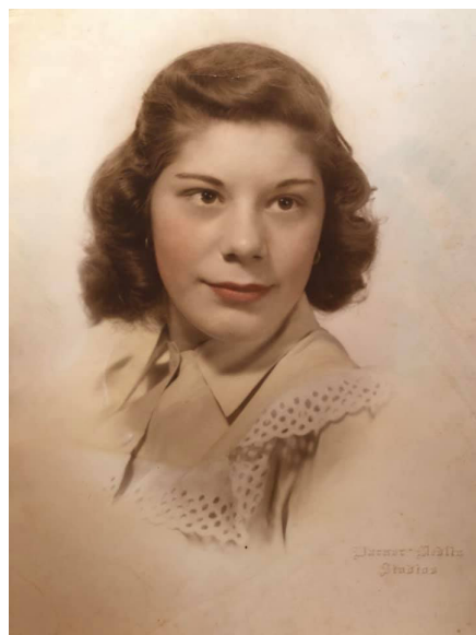
8th Grade Graduation