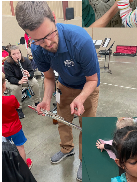
Mount Pisgah Academy Band Visits the School