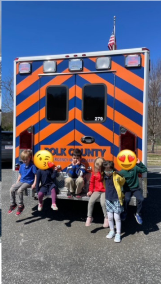
Polk County EMS Visits the School